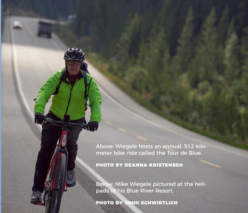
Above: Wiegele hosts an annual, 512-kilometer bike ride called the Tour de Blue.