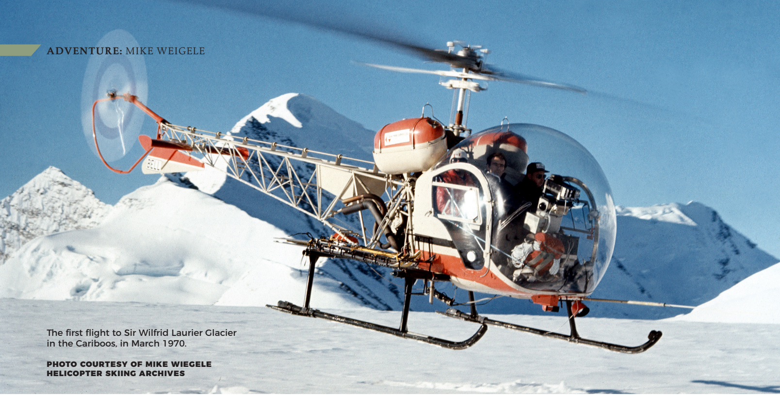
The first flight to Sir Wilfrid Laurier Glacier in the Cariboos, in March 1970.